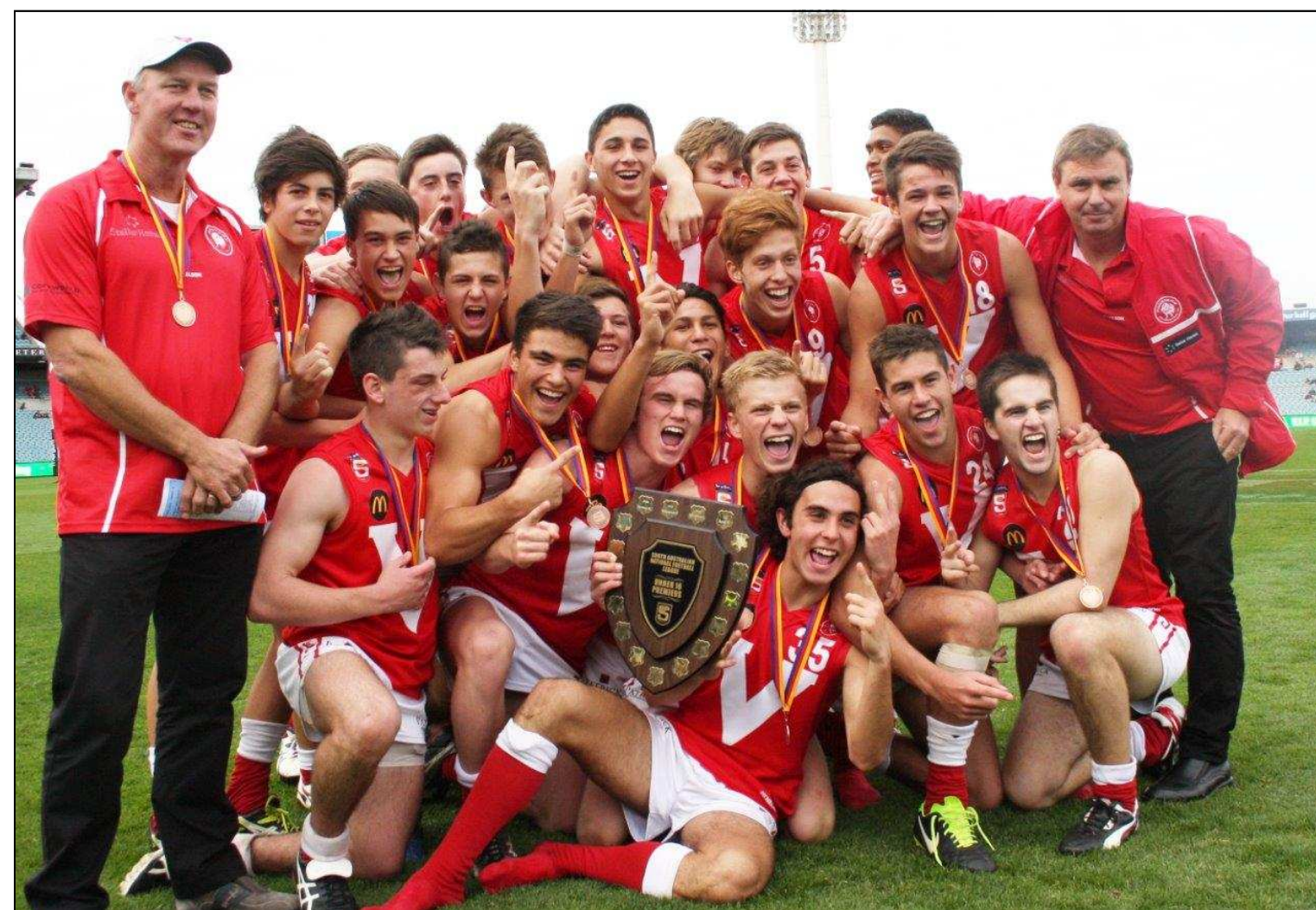
Winners are grinners

Their only close game was a one point victory against Norwood in the abridged minor round, without 10 key players, but they rebounded the next week to beat the Redlegs by over 19 goals on Semi Final Friday.