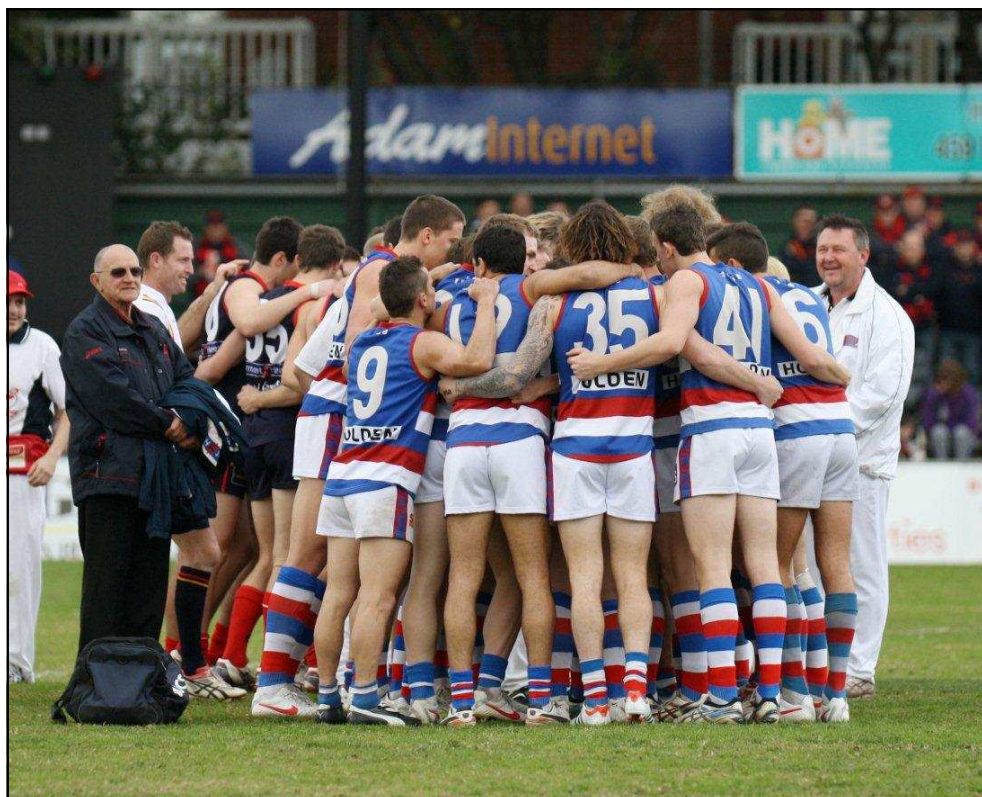
Getting ready to rumble