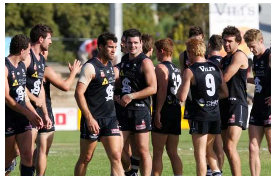
Panthers Post Match @ Prospect

The corresponding match last year was a four point thriller in favour of the home side - and while I can't see the margin being much more, feel the tables will be turned this time.